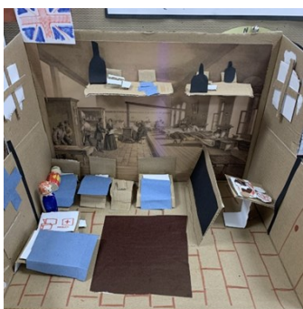
A Scutari hospital diorama

Year 2 have also developed their understanding of chronology by ordering the events of the fire and understanding when the Great Fire happened in relation to the Crimean War.