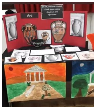
Exhibited art work by Year 5

Year 6 have had the opportunity to explore the events of World War II this term, discussing and analysing the effects it had upon children and families. They have been able to empathise with characters from our whole class texts: Letters from the Lighthouse by Emma Carroll and A Christmas Carol by Charles Dickens, considering the underlying morals and themes in these novels. In relation to their reading text, children designed and created their own lighthouses which were then used in our science lessons based on electricity. Children used their knowledge of circuits to help make their lighthouses light up. Within our history and geography lessons, children have discussed the Empire and investigated the impact it had on the victory of Great Britain, as well as delving into other lines of historical enquiry such as evacuation, rationing, allies and axis, the Battle of Britain including the Blitz and the location of the countries involved in the war as well as drawing inspiration from a World War II artist – Henry Moore.