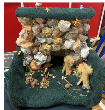
A recreation of a Stone Age cave.

The children were fully engaged in their learning and have a much deeper understanding of the lives people led before history was recorded. The end-of-term exhibition showcased all their learning and the children answered their enquiry question with great confidence and skill. We look forward to Spring and our next enquiry question challenge!