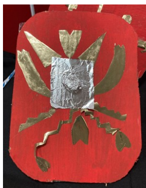
One of our Yr5 Roman shields

Year 5's enquiry question was, 'What was life like in Ancient Greece?'. The children enjoyed reading the whole class text, 'Who Let the Gods Out' and have written non-chronological reports, diaries, stories and letters. We have worked to understand the plot twists, characters and use of language in the book.